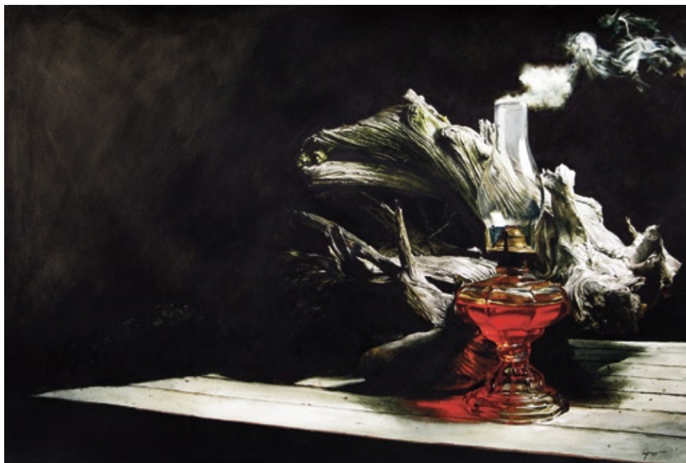
HURRICANE, WATERCOLOR ON PAPER, 23 X 34"