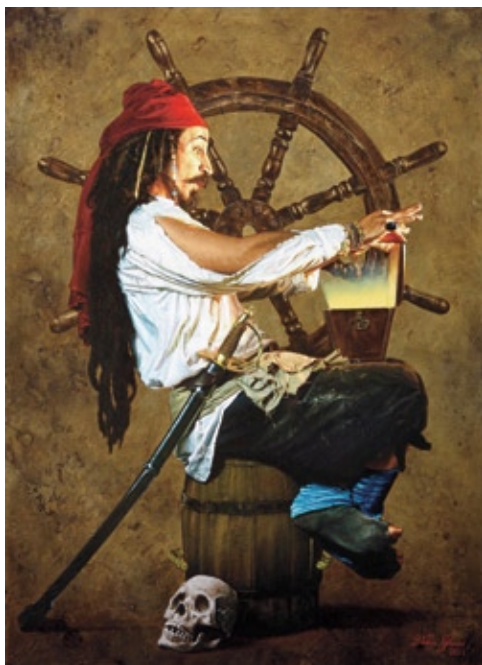
THE PICAROON, OIL ON LINEN, 36 X 26"