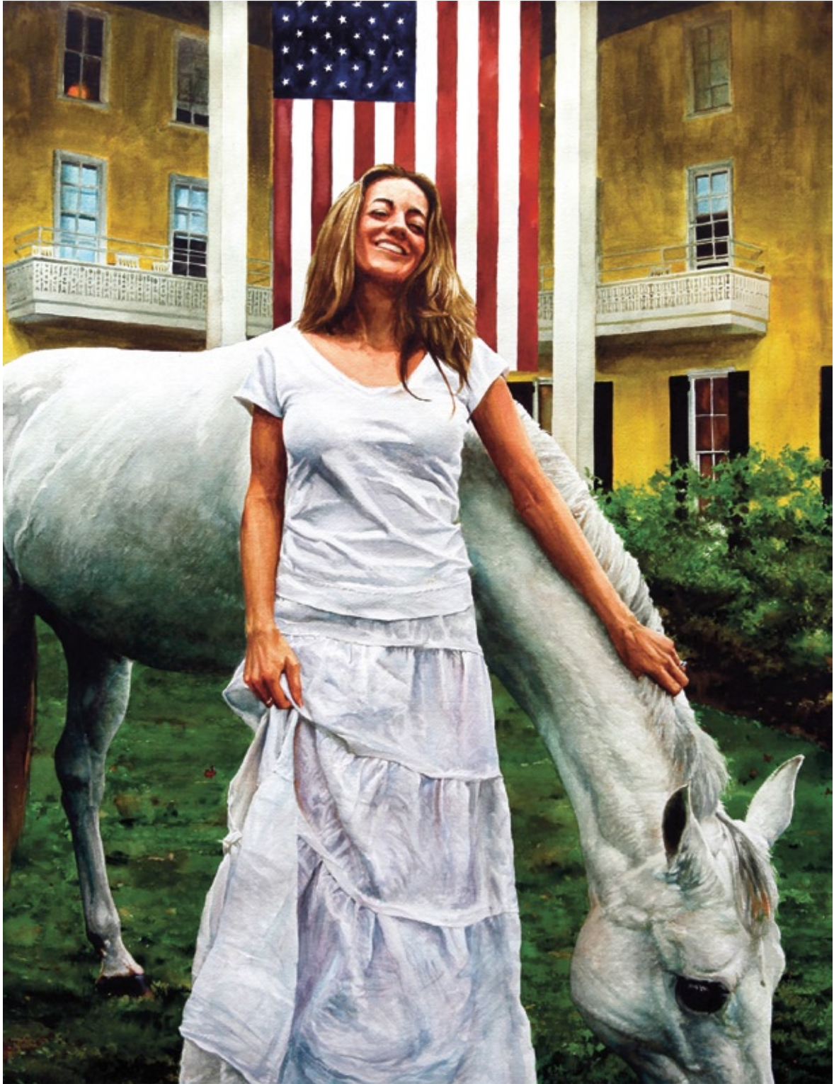
LIBERTAS, WATERCOLOR ON PAPER, 28 X 22"